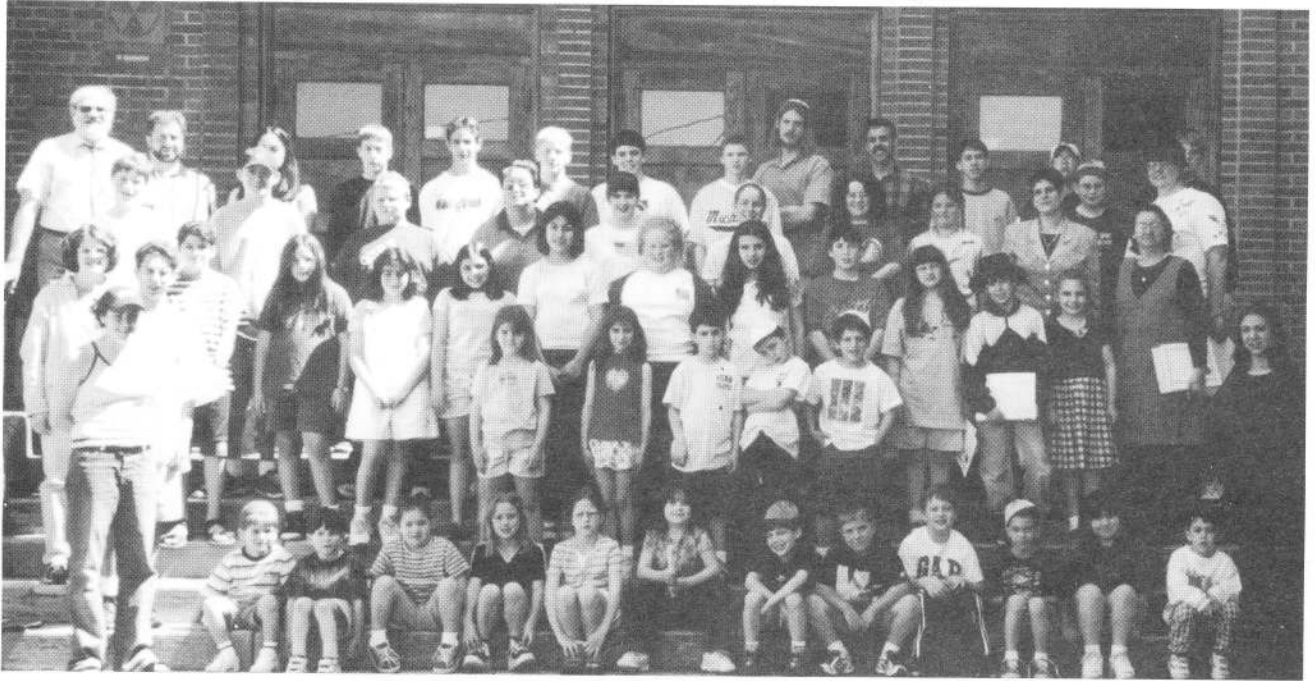
The 1998-1999 Altoona Community Sunday School mugged for the camera on the last day.

Altoona Federation of Jewish Philanthropies 1308 17th Street Altoona, PA 16601