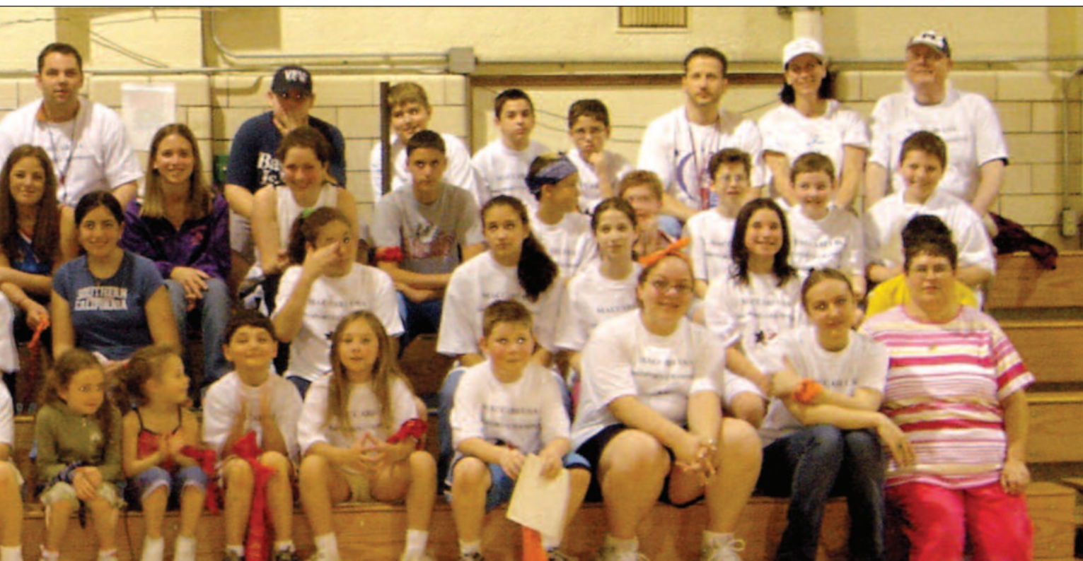
al day of Sunday School. Each of the students took part in a variety of games and competitions and each received a trophy