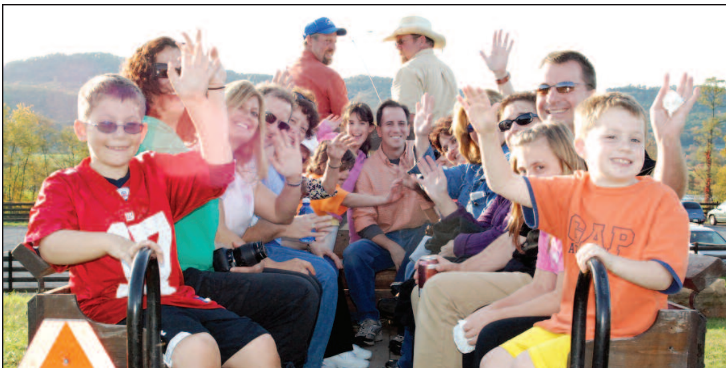
Members of the Jewish Community wave while enjoying a fall hayride at Diamond Carriage Lane near Roaring Spring. The hayride was our first such venture, and more than 70 attended.

February 2009 Issue No. 17 Federation: 515-1182 E-mail: altfed@atlanticbb.net