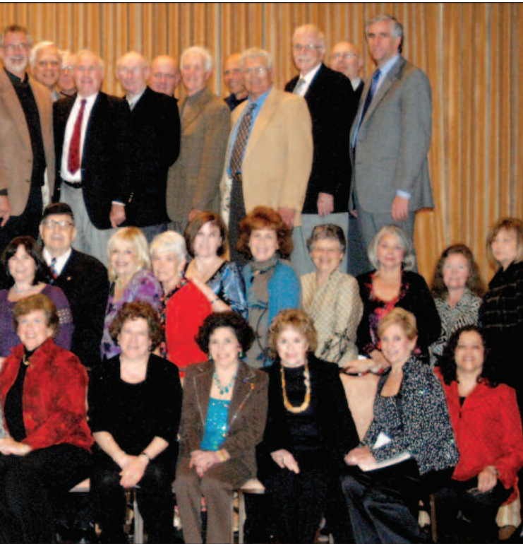
crowd of over 100 members and friends in November. Rabbi