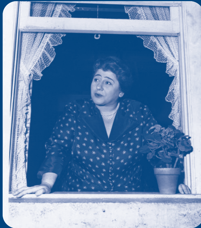
Yoo Hoo Mrs. Goldberg February 24, 2011